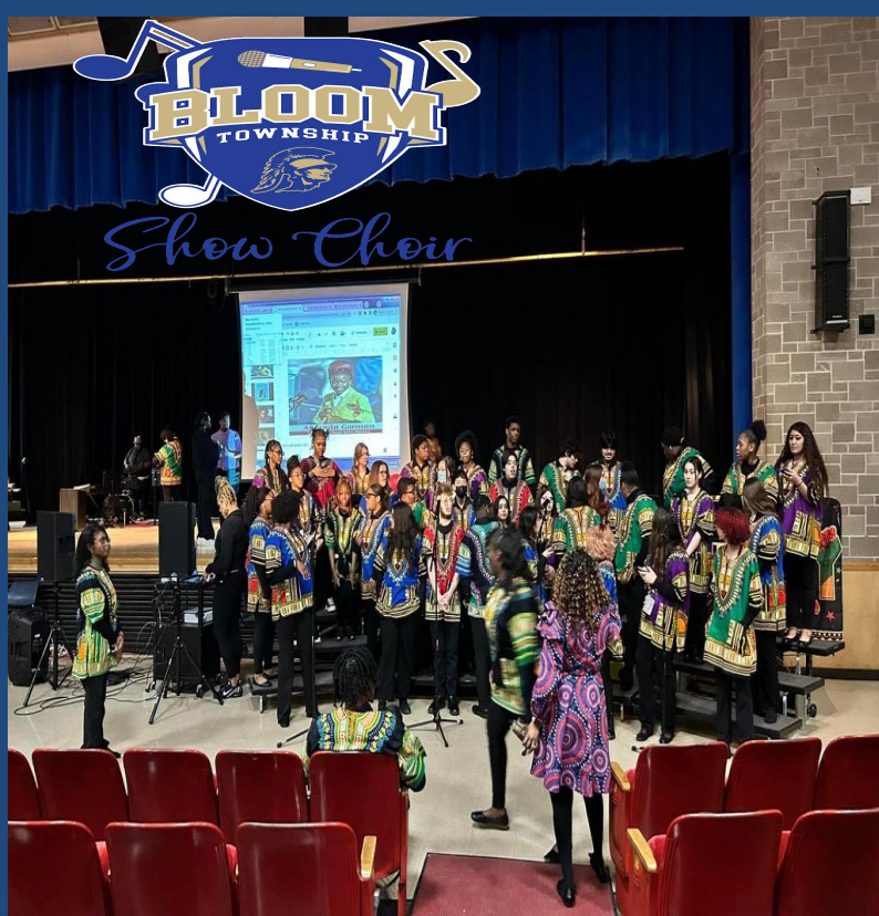
Congresswoman Robin Kelly Scholarship Luncheon